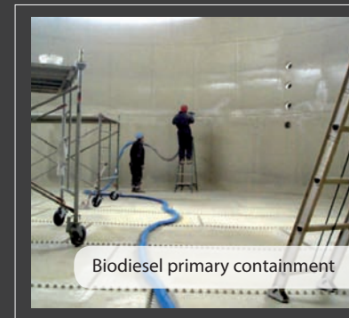
Biodiesel primary containment

Polyshield HT-100F™ is a fast-set, high-performance, spray-applied, plural-component, pure polyurea elastomer. This system is based on amine-terminated polyether resins, amine chain extenders, and prepolymers. It provides a cost-effective flexible, tough, resilient monolithic membrane with water and chemical resistance. Polyshield HT-100F™ is an excellent choice of elastomer to topcoat geo-textile fabrics for primary or secondary containment.