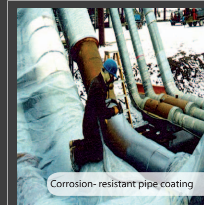
Corrosion-resistant pipe coating