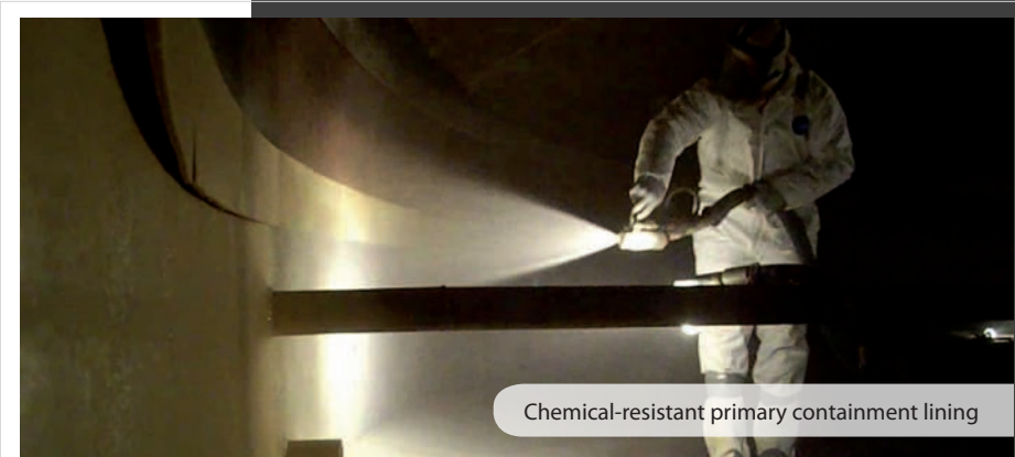
Chemical-resistant primary containment lining