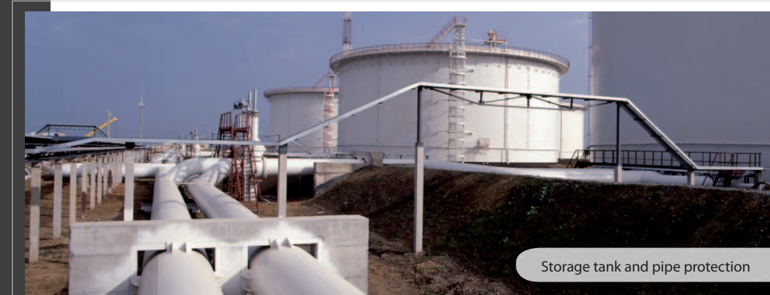
Storage tank and pipe protection