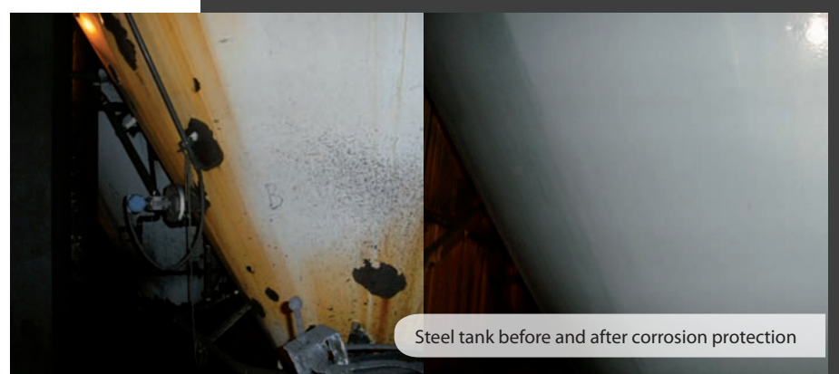
Steel tank before and after corrosion protection