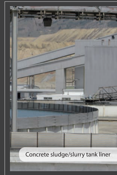
Concrete sludge/slurry tank liner

PTU™ is a new generation of high-performance polyurea coating and is the result of six years of development and field testing. This chemical resistant coating provides high-ductility, allowing it to move with expanding and contracting surfaces. PTU™ can be sprayed to any thickness in one application and returned to service in a matter of hours.