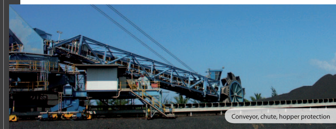
Conveyor, chute, hopper protection