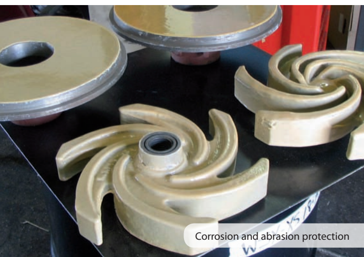
Corrosion and abrasion protection

Evaporation pit and earthen containment liners